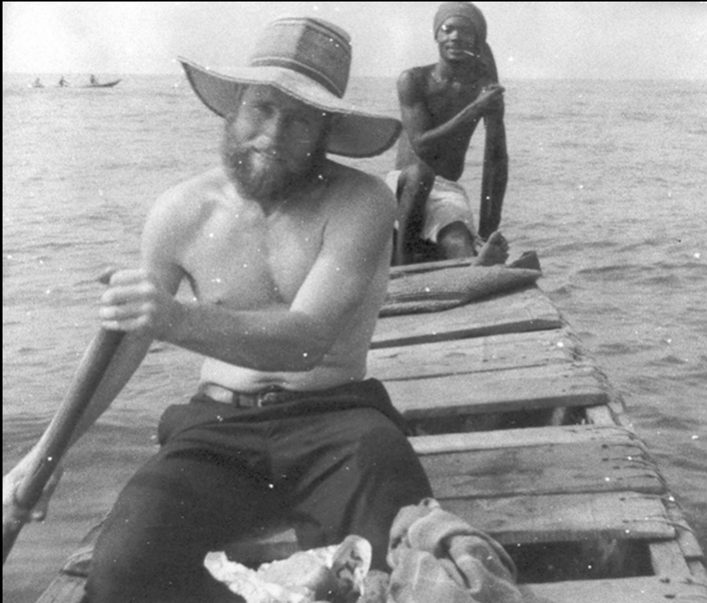
Cape Coast, Ghana 1974