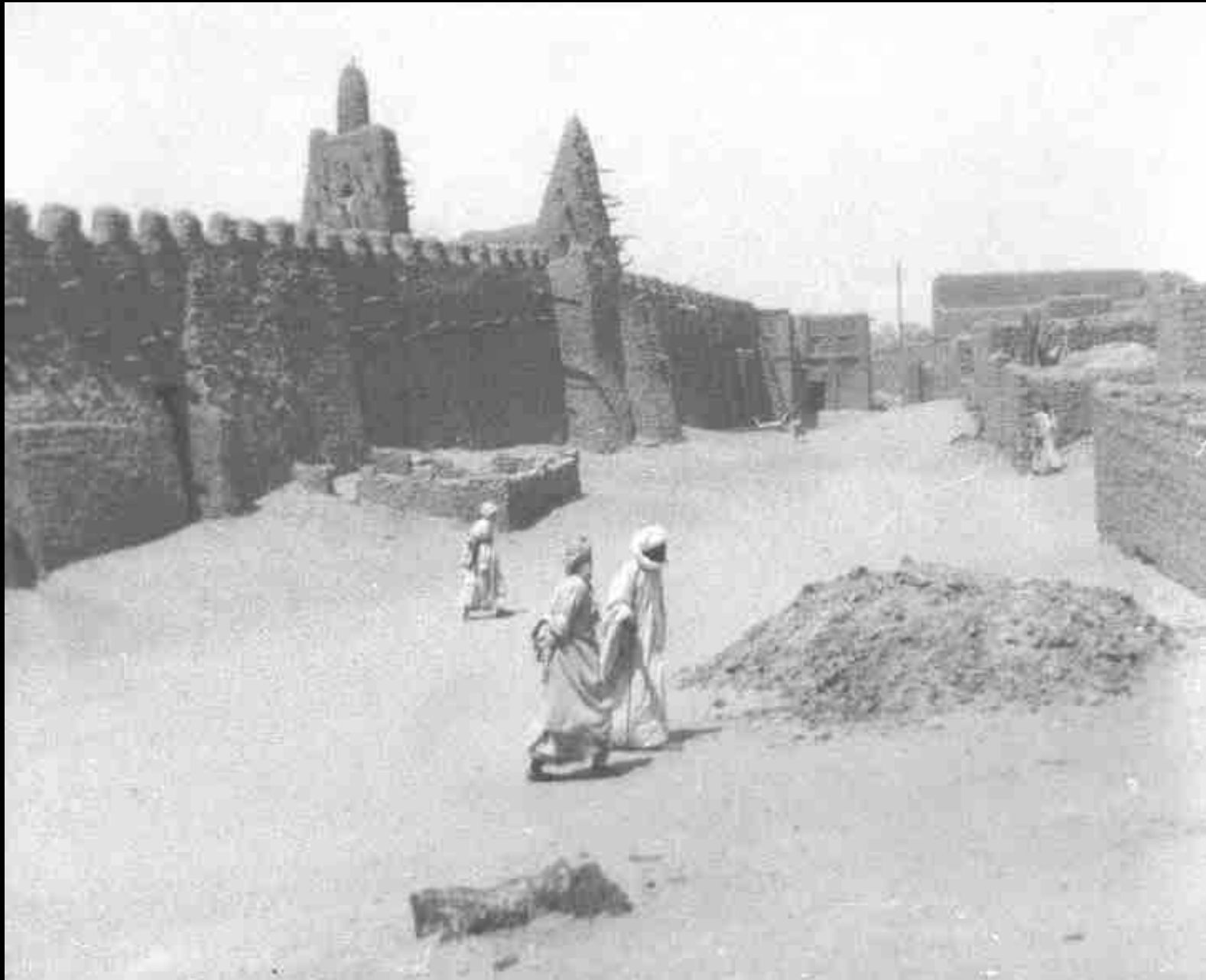
Mosque, Timbuktu, Mali. Photo: Tom Nordblom 1974