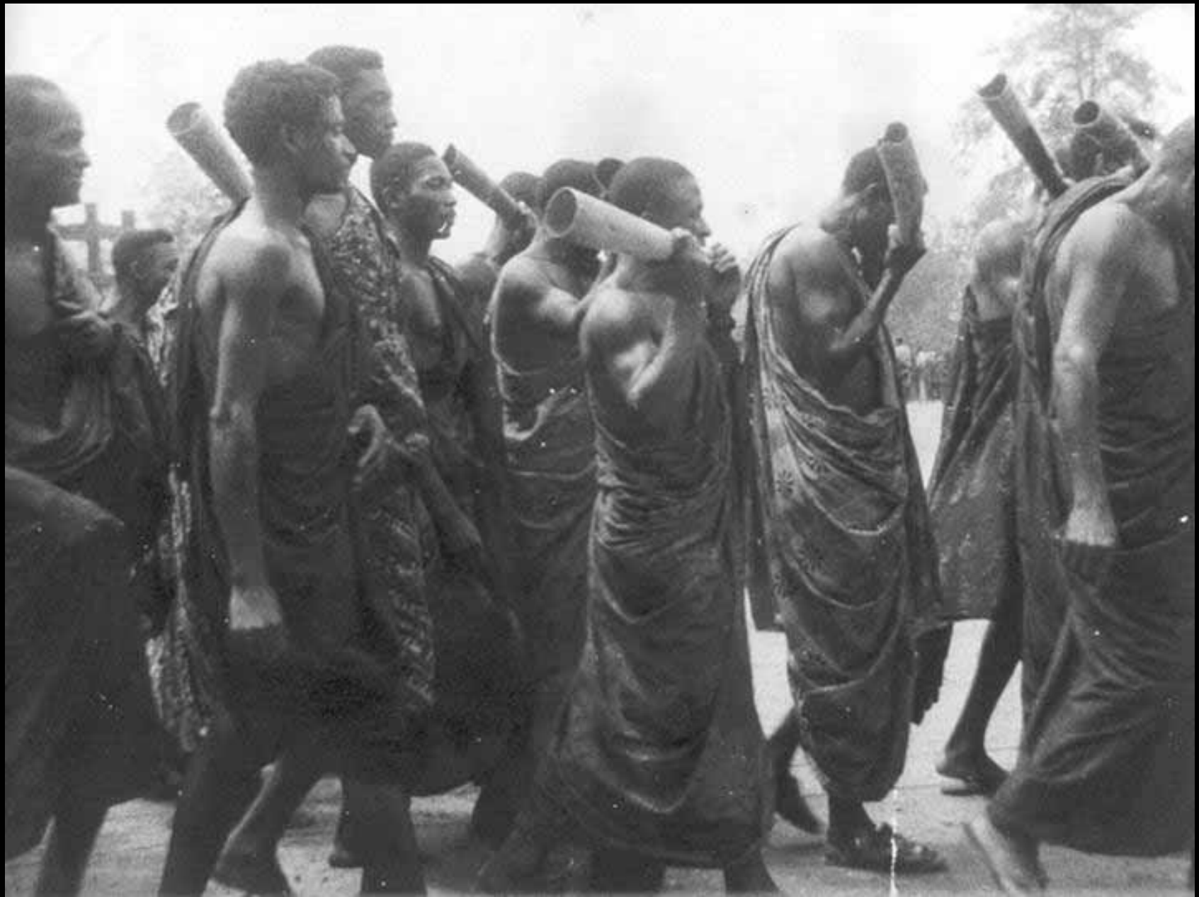
Celebration at Kumasi, Ghana 1974.